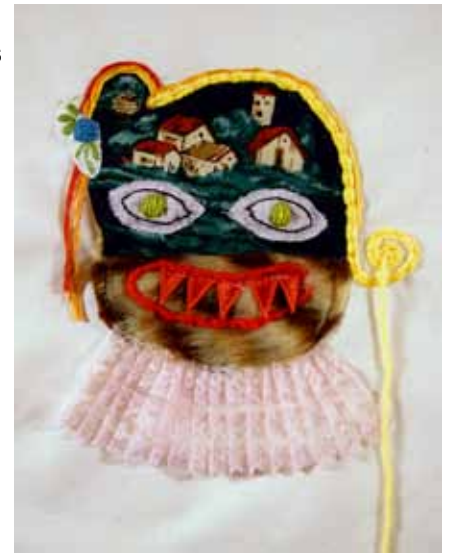
The Snake Puppet

Artist Talk, April 16, 5 pm Opening, April 16, 6-9 pm